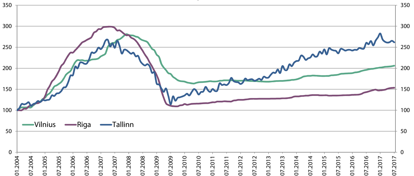
OBER-HAUS BALTIC APARTMENT PRICE INDEX (January 2004 = 100)